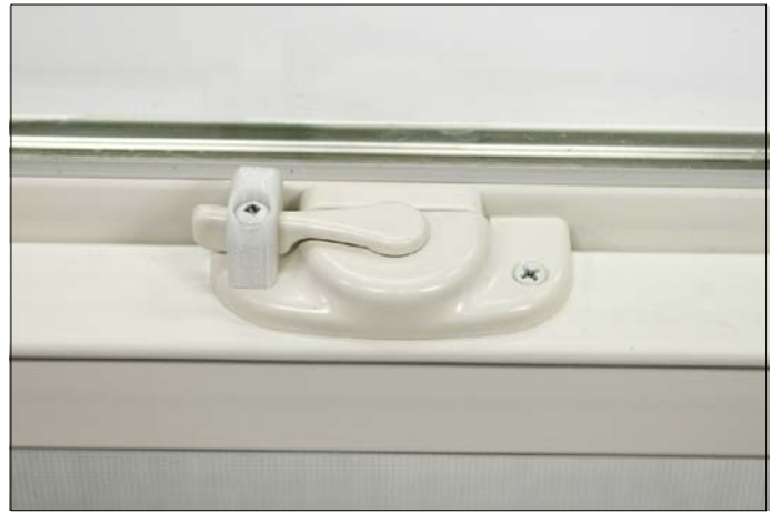
Figure 4: Non-operable lock component installed. Install the warning label included with your kit on the window.