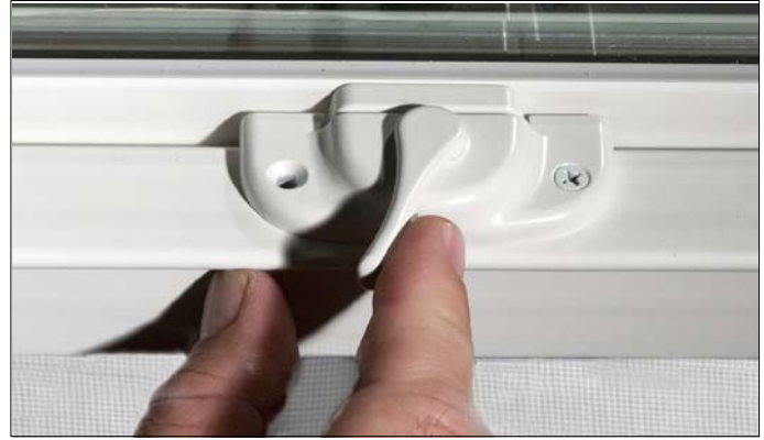
Figure 2: Close the lock.