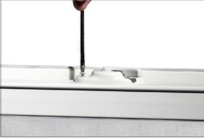
Figure 1: Open the lock and remove the existing screw.